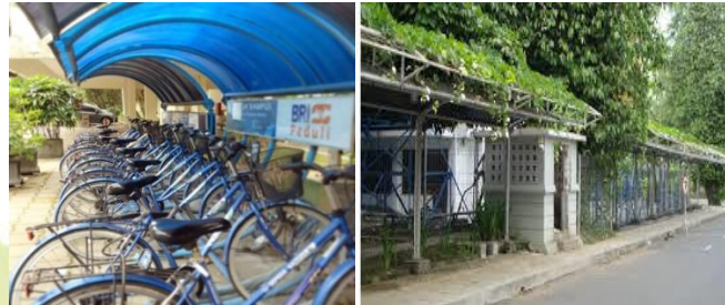
Figure 4 (a) Bike Station; (b) Pedestrian facilities

water facilities, safe and comfortable (protected) walking space which by creating a canopy along the way and liaison between the faculty in order to be protected from the sun and the rain.