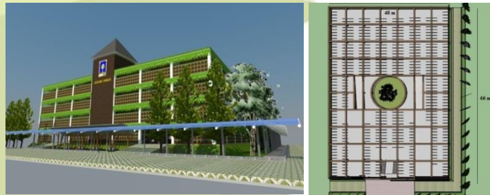
Figure 3 Vertical Parking Building

addition, it will be the good meeting point. The development of vertical parking building can be developed by more accompanying some facilities such as a restaurant /cafe, minimarket, photocopy facilities, Automatic Teller Machine, etc. The concept used is to force the student motorists who want to go to Campus to park their motorcycles in the centralized parking at spacious provided location. Meanwhile, the existing parking lot inside the campus is dedicated only for lecturers, staffs and visitors who should receive first priority for convenience (ITE,1992). Students who had parked their motorcycles in the centralized parking at the vertical parking building can go to the intended campus using provided bicycles or by walking if it is close to campus buildings. This facility is very important to decrease the pollution inside the campus. Due to the big number of students' motorcycle in the campus such as UII, it is necessary to find spacious location to accommodate them. According to the regulation from Ministry of Transportation of Indonesia (1996), the needs of parking space of the integrated campus such as UII are 4,864 m 2 . Due to the limited land, the solution for parking areas will be made in vertical building. With the available land of about 2,500 m 2 , then it only needs = 4,864 \text{ m}^2 / 2,500 \text{ m}^2 = 1.94 \approx 2 floors. To meet the next 5 years needs, it should facilitate = 8,000 \text{ m}^2 / 2,500 \text{ m}^2 = 3.2 \approx 3 floors.