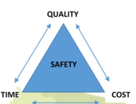
Figure 2 Illustration of Relations between Occupational Safety and Triple Constraint

In this research, there will be an integration of safety in standards operating procedures of work of reinforced concrete column.