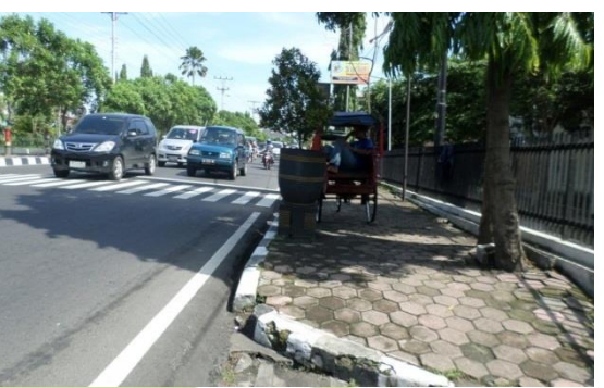
Figure 2. Existing Condition on Jalan Pahlawan